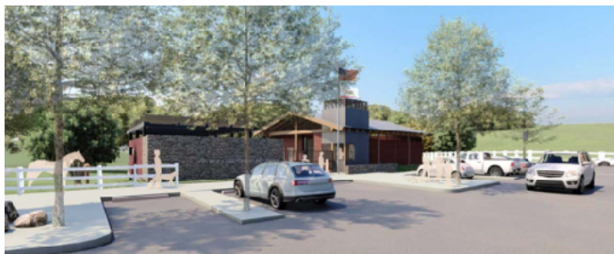
Proposed Nature Center Community Center

The City of RHE has proposed demolishing the George F Canyon Nature Center Facility and constructing and operating a new Nature Center Community Center. The new facility will be a single-level building with a view