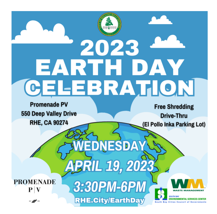
The City's Annual Earth Day Celebration, in partnership with Waste Management, South Bay Environmental Services Center and the Promenade PV will be held <a href="Wednesday">Wednesday</a>, April 19th from 3:30 to 6:00 pm Promenade PV, 550 Deep Valley Drive

Earth Day Celebration: On Wednesday, April 19, from 3:30 to 6:00 p.m., the City, in partnership with Waste Management, South Bay Environmental Services Center, and the Promenade PV, will celebrate Earth Day 2023. The location is the Promenade PV at 550 Deep Valley Drive. In addition, a student art contest for grades K-8 and free paper shredding services will be available in the parking lot near El Pollo Inka Restaurant.