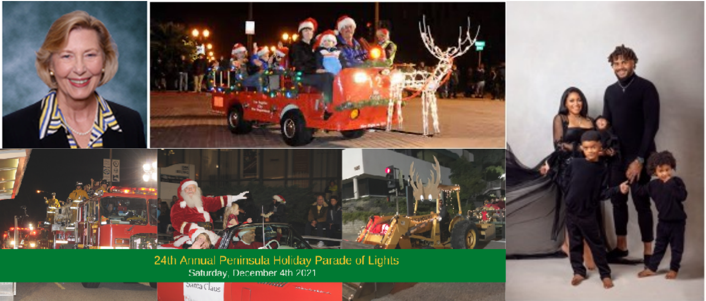
24th Annual Peninsula Holiday Parade of Lights Saturday, December 4th 2021

The Annual Rolling Hills Estates Holiday Parade of Lights was held on Saturday evening, December 4. The parade route was around the Peninsula Center along the Silver Spur Road and Deep Valley Drive. Several hundred residents enjoyed the event so be sure to catch it next year if you missed the parade in 2021.